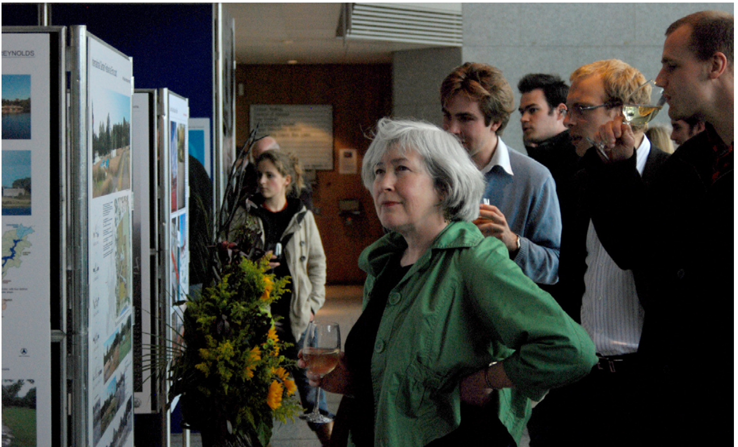
Visitors viewing display panels at the exhibition launch

The Irish Landscape Institute Exhibition of Contemporary Landscape Architecture in Ireland enjoyed a well attended and successful launch. The exhibition was formally open by Minister for the Environment, Heritage and Local Government; John Gormley.